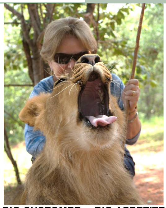
BIG CUSTOMER... BIG APPETITE

Taming an African lion takes great skill, patience and a lot of know-how. The same qualifications as the broker you need to tame hungry buyers who want it both ways.