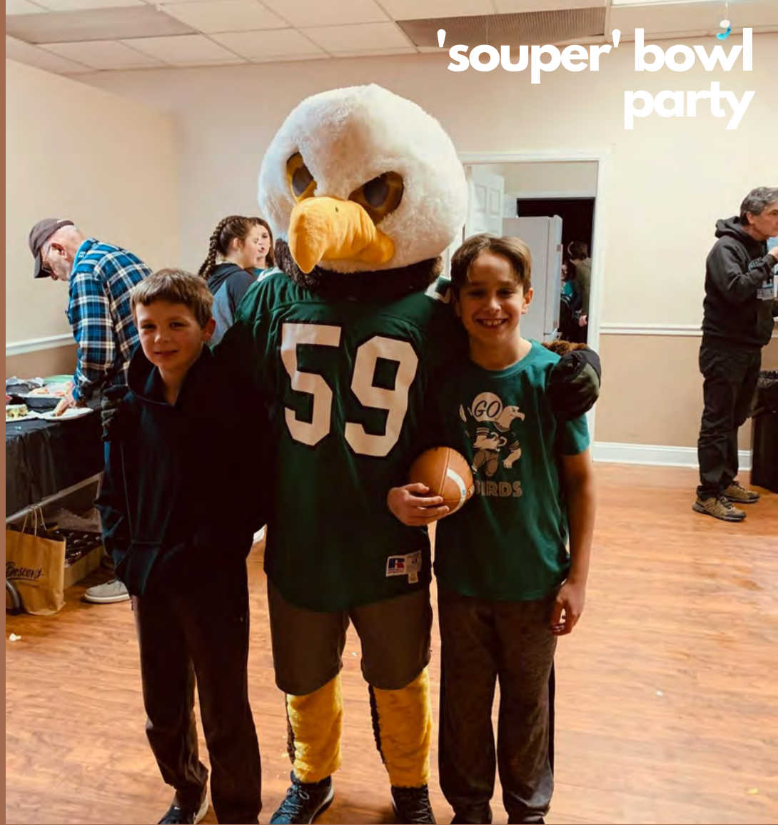
'souper' bowl party